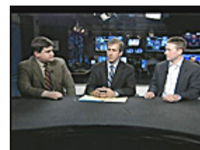
D.C. political video roundtable