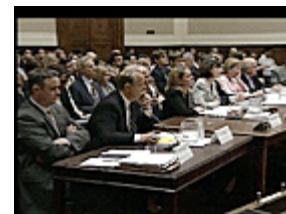
Latest news video